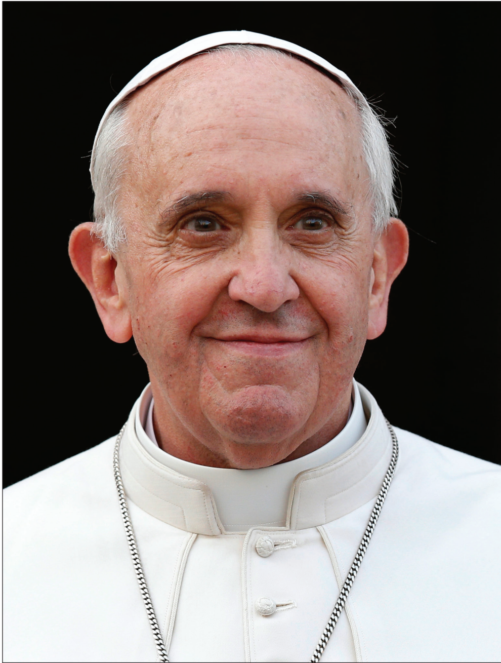
HIS HOLINESS POPE FRANCIS