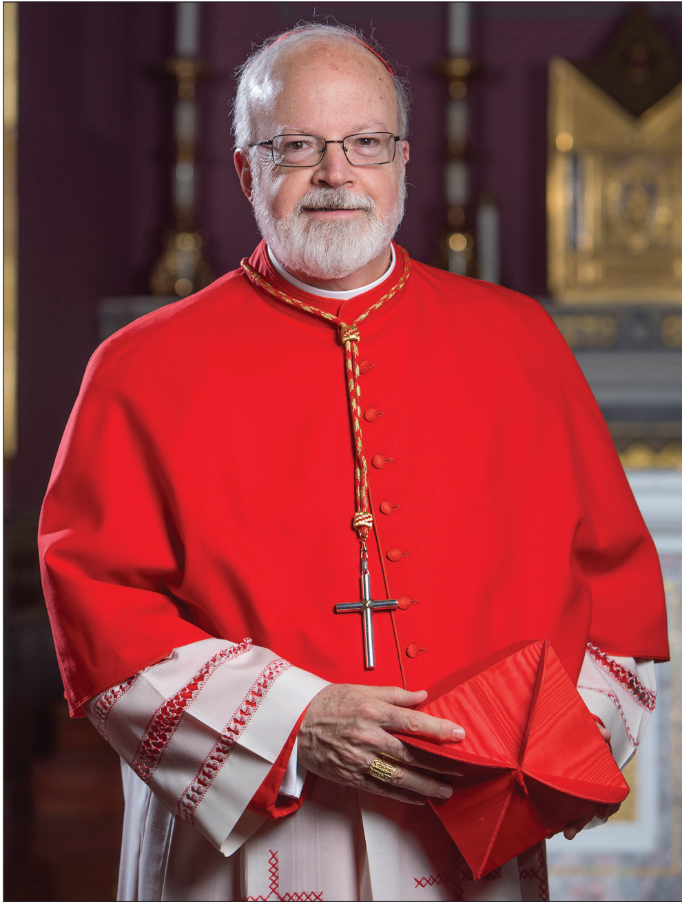
HIS EMINENCE SEÁN PATRICK CARDINAL O'MALLEY, O.F.M. CAP. ARCHBISHOP OF BOSTON PRINCIPAL CONSECRATOR