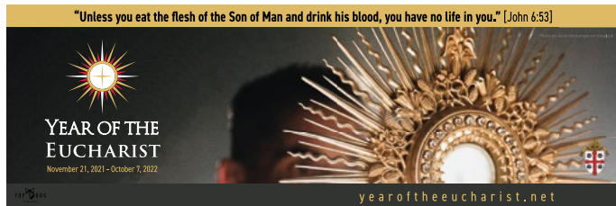
PICTURED: 2'x6' BANNER

FULL COLOR, 15 OZ VINYL & MESH BANNERS, GROMMETS ON EACH CORNER & EVERY 2-3 FEET TOP AND BOTTOM. HEMMED ON 4 SIDES.